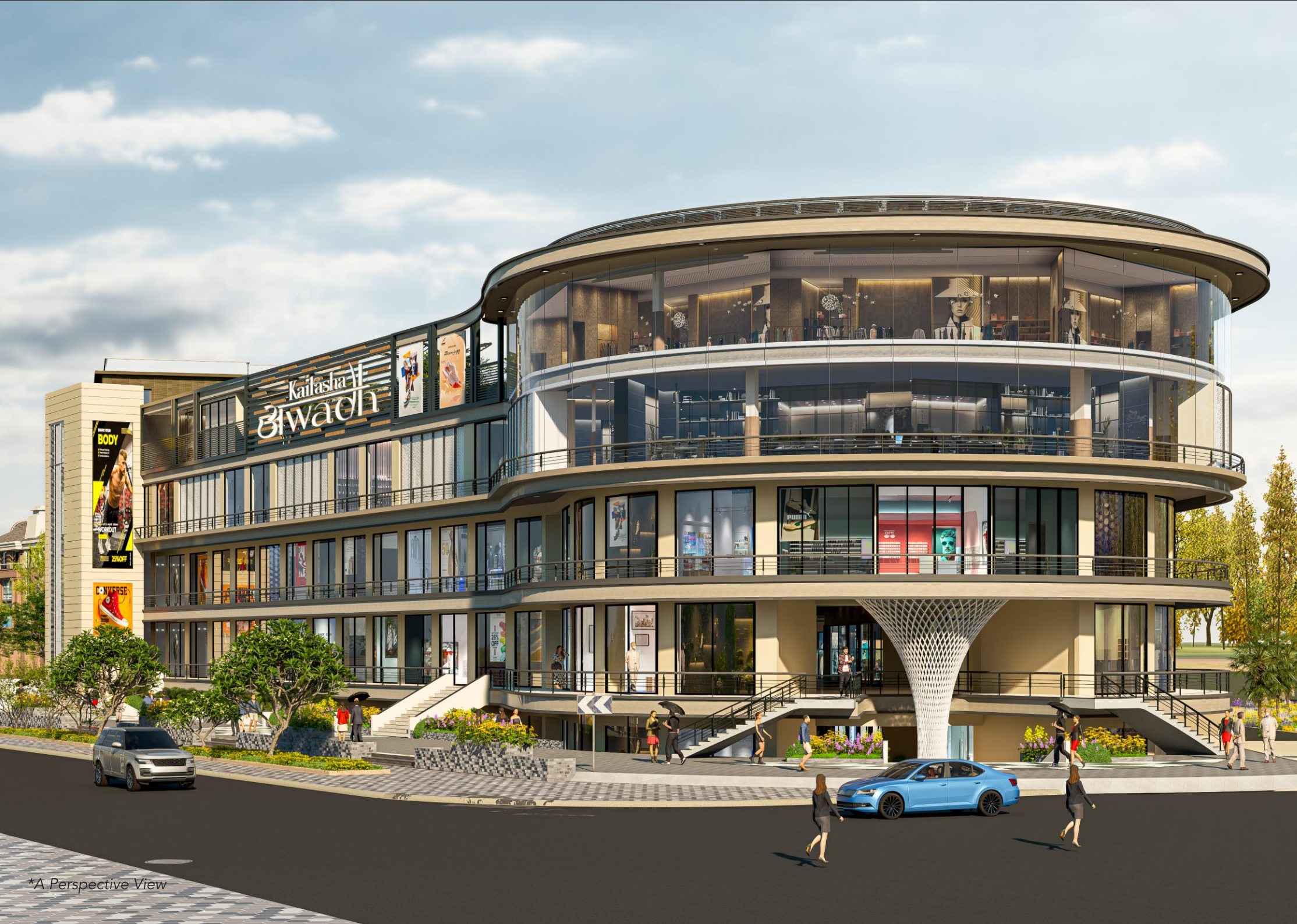
*A Perspective View